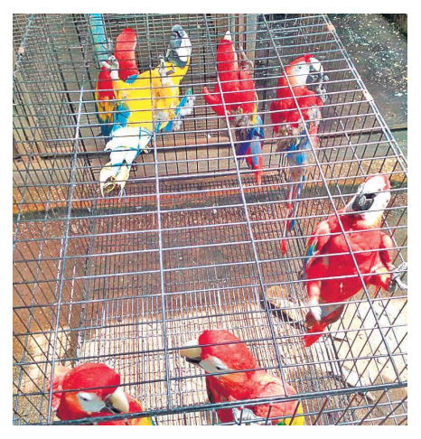
Around 100 different species of foreign birds and animals were seized from the gang by the Directorate of Revenue Intelligence, in the city