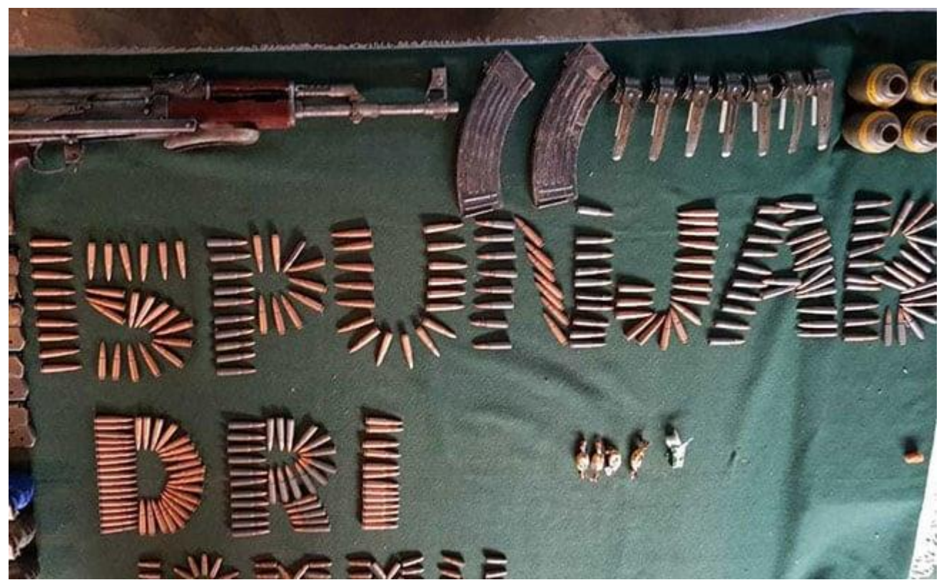
The arms and ammunition bearing distinct Chinese markings were being smuggled from Pakistan

All India | Indo-Asian News Service | Updated: November 14, 2018 20:48 IST