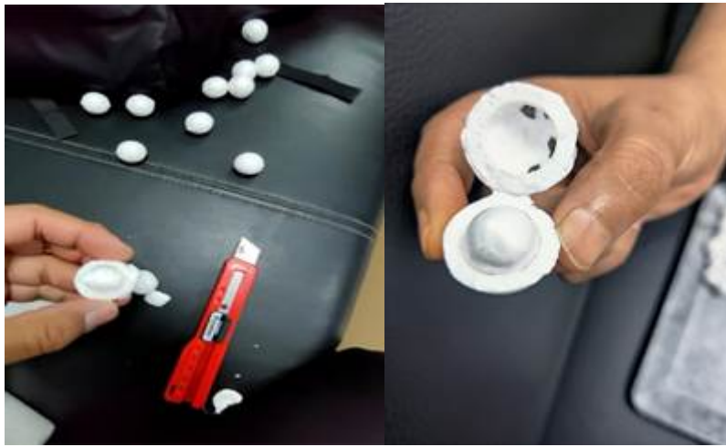
Balls of Cocaine, covered by thin transparent polythene, concealed inside thermocol balls