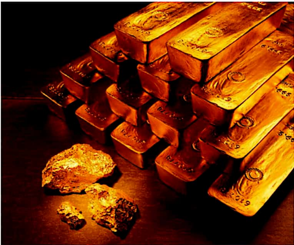
The sleuths intercepted six passengers and seized gold in compound-mixed-paste form strapped on to their bodies

Bellie Thomas, DH News Service, Bengaluru, OCT 18 2018, 01:12AM IST | UPDATED: OCT 18 2018, 01:17AM IST