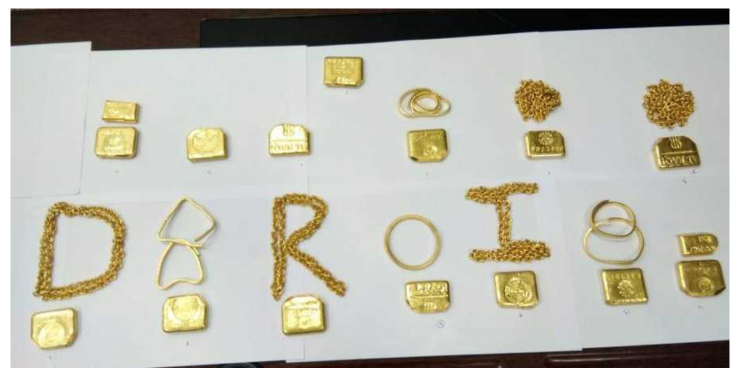
Gold seized from Umrah pilgrims at Hyderabad airport.